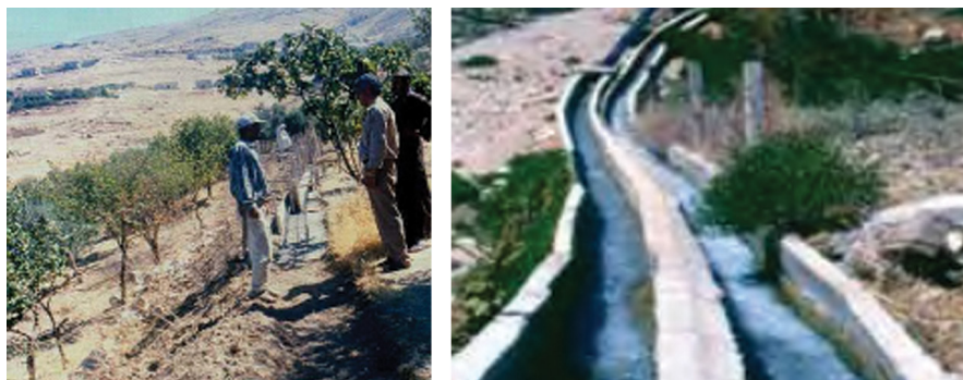
Large amounts of water are lost from unimproved irrigation canals (left). Concrete-lined canals (right) and plastic pipes avoid these losses, delivering more water to the farmers.

Traditional spring-fed irrigation systems in the Karak region of Jordan waste a lot of water, reducing productivity of olive orchards and the amount of land that can be irrigated. A MENARID project has demonstrated that replacing traditional unlined irrigation canals with narrow, concrete-lined canals can double or treble the amount of water a farmer receives, boosting olive yields and allowing other high-value crops to be introduced into the farming system. Rehabilitating old olive trees further increases yields and farmer income.